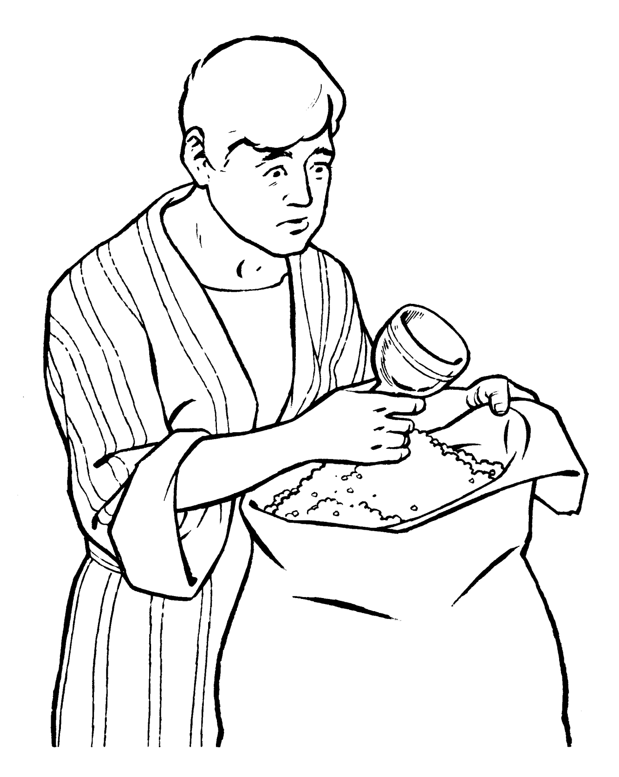
Benjamin finds Joseph's favorite silver cup in his sack of grain!

Parents: Explain why Joseph had his silver cup placed in Benjamin's sack of grain.