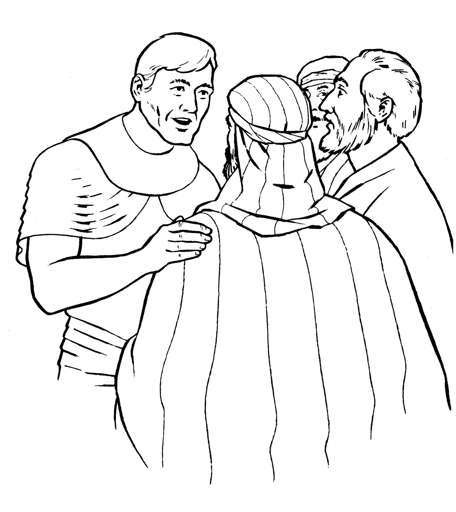
Joseph tells his brothers who he is!